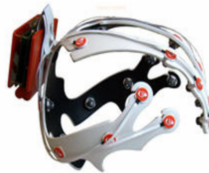
This device is not available to consumers. The consumer version will be announced at a later date.

The company webpage claims that they provide the ultimate human-computer interface and that they are pioneers in brain computer interface technology. In their press release of March 7 th 2007 they state that